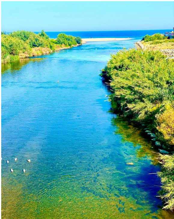
Sant Andria de Besos, Barcelona, Spain