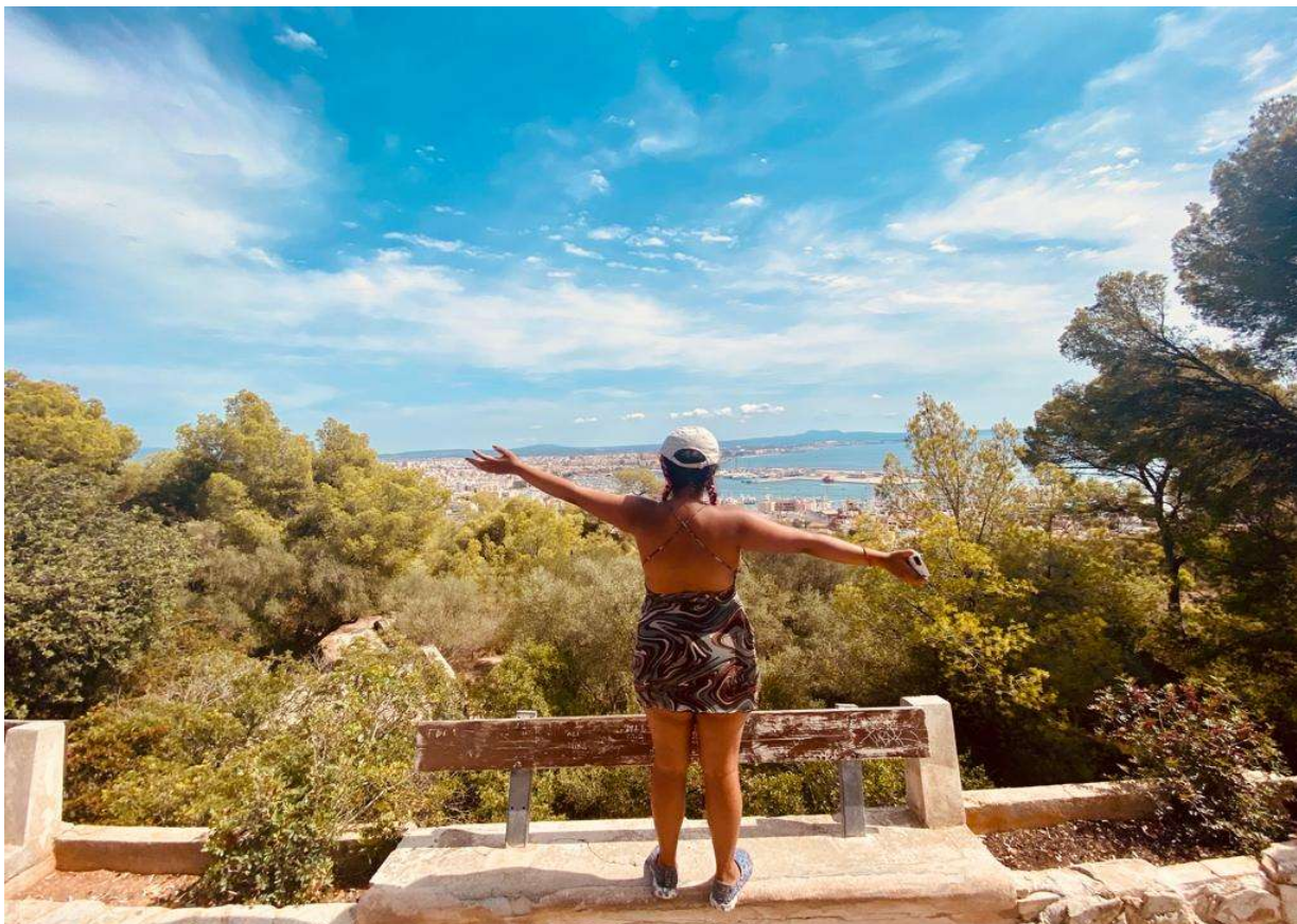
Palma de Mallorca, Spain