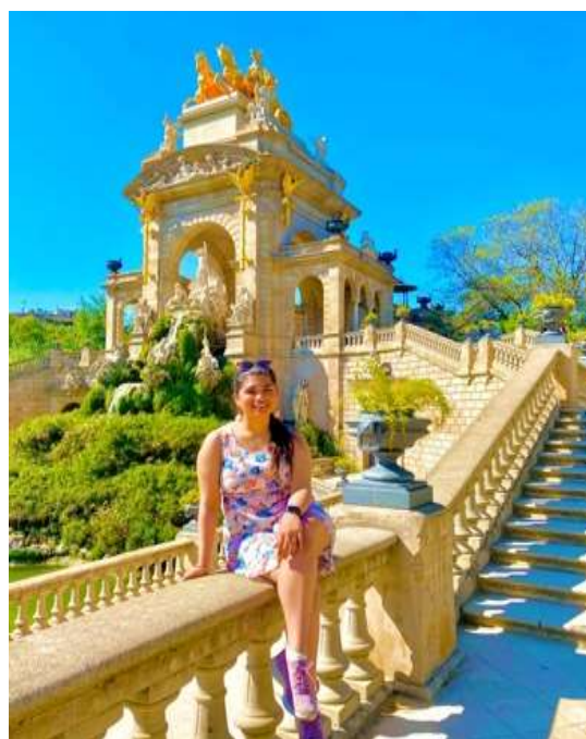
Ciudella Park, Barcelona, Spain