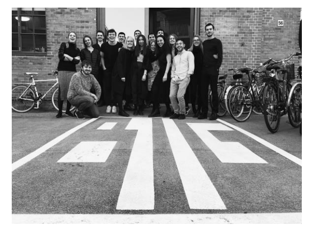
Pic 04. Office spaces