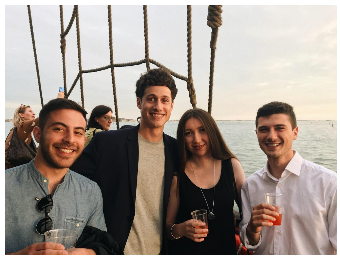
Pic 03. BIG boat party in Venice