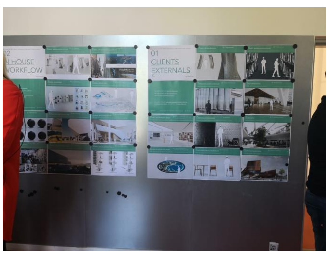
VR tool used for design development.