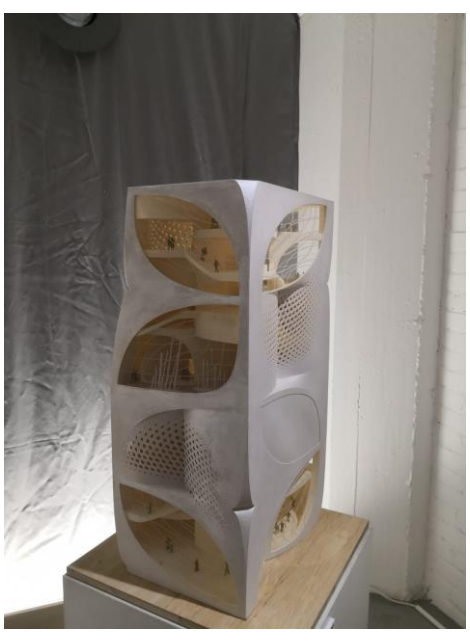
Models show Room.